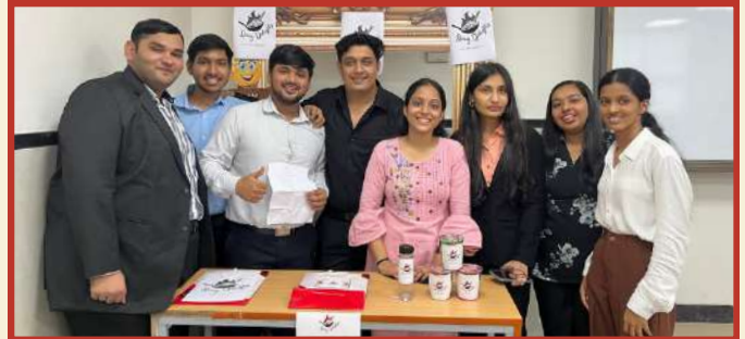
International Marketing Model