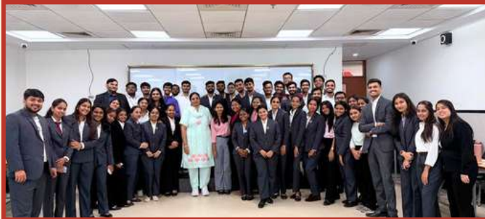
International Marketing Model