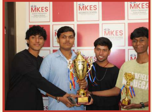
BGMI Winning Team

Beyond the screen, it was all about presence of mind. BGMI turned strategy into survival