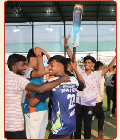
CRICKET WINNING TEAM

Measured in overs, decided in moments. Cricket became a game of quiet turning points.