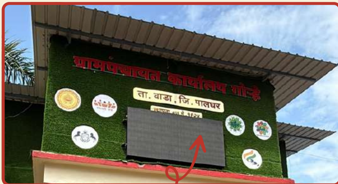
Gram Panchayat Office - Gohra