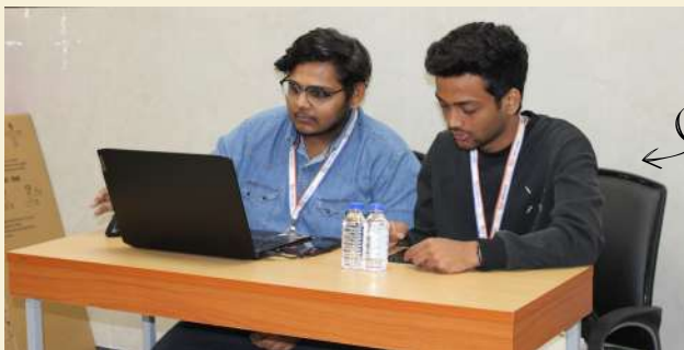
Behind the scenes

Beyond the screen, it was all about presence of mind. BGMI turned strategy into survival