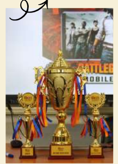
Honouring the BGMI Champions