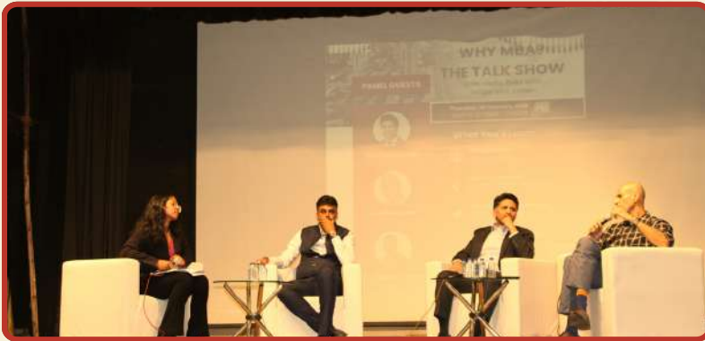
THE TALK SHOW BEGINS

"An MBA doesn't just add to your resume—it upgrades your mindset, turns ambition into action and, ideas into impact."