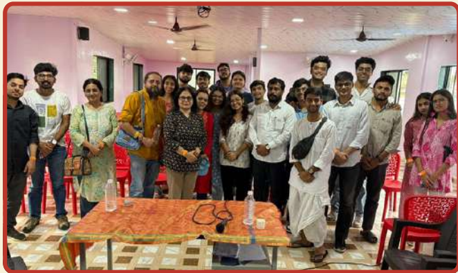
The Rural Immersion visit exposed students to real-world rural markets and communities.

Villages Visited- Gohra, Nanhe and Hamrapur in Wada Taluka